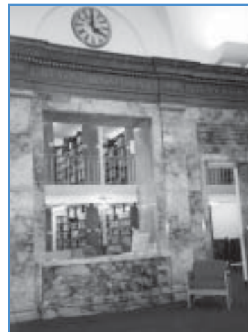
Restored circulation desk, Rockville Public Library